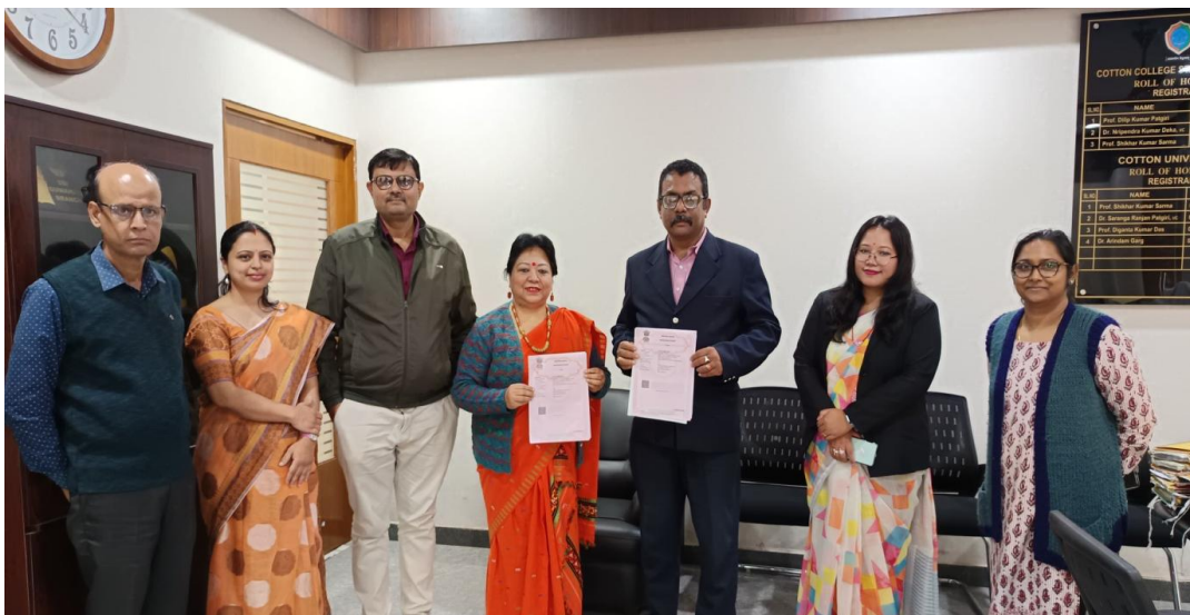
With the signatories of both the parties (Cotton University & DHAS)