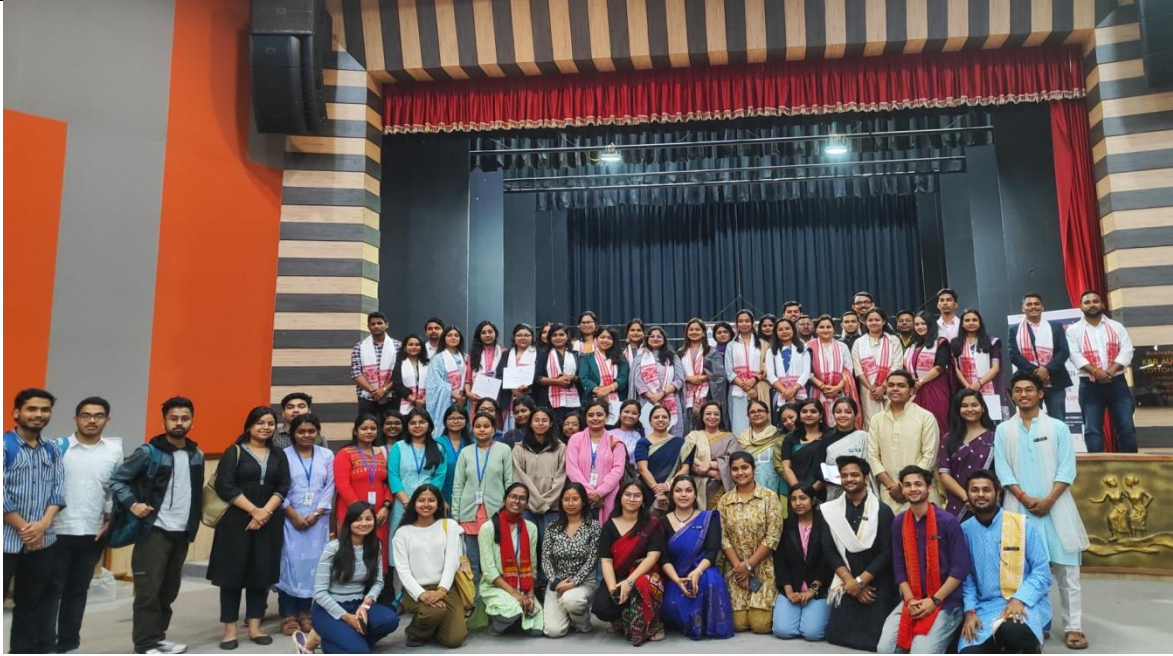
With the APSC Achievers of Cotton University